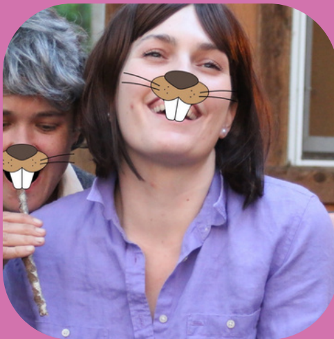
INA GNAWTEN BEST TALENT