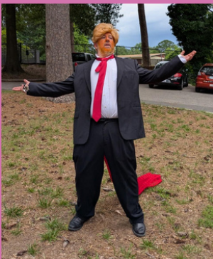
DONALD STUMP BIGGEST LOSER

← except this "contestant" no thanks to this loser