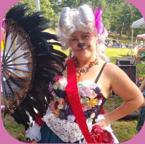
LADY VIOLET BEAVERTON BEAVER QUEEN