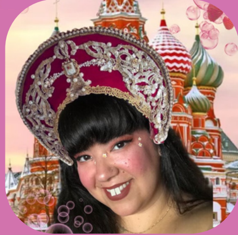
MADAME RASPBOOTYN PEOPLE'S CHOICE BEST TAIL AND COSTUMING MOST SAGACIOUS